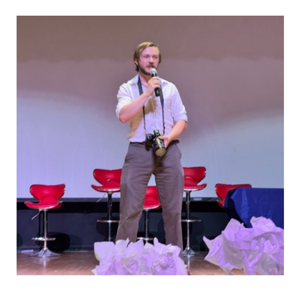
PAGE FOUR | JOURNEY

We extend our heartfelt thanks to the facilitators and administrators who put their time and effort into orchestrating this enriching experience each year. Without their dedication and meticulous planning, none of this would be possible. Their dedication to ensuring a seamless and impactful program is truly commendable, and we are deeply appreciative of their hard work