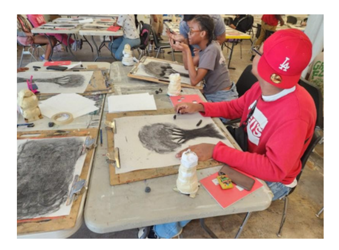
PAGE FIVE | JOURNEY